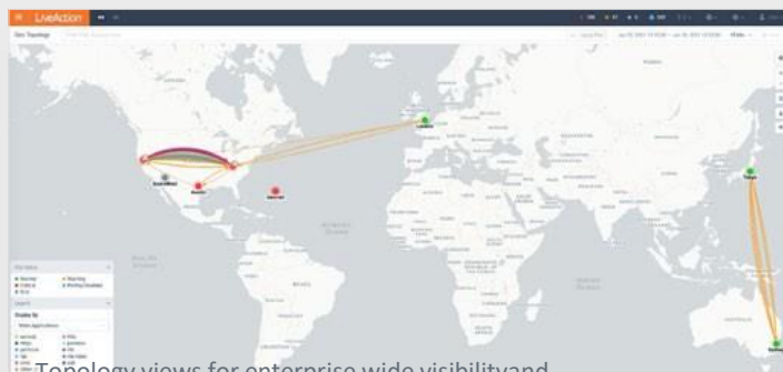
Topology views for enterprise wide visibility and situational awareness